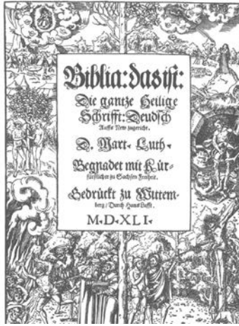
Title page from an early printing of Luther's translation.

What version of the Bible do you hear and read? Just in English, we have many to choose from. They range from translations that aim to be as accurate as possible (such as the New Revised Standard Version) to others whose main objective is to be easy to understand, even if certain details get lost.