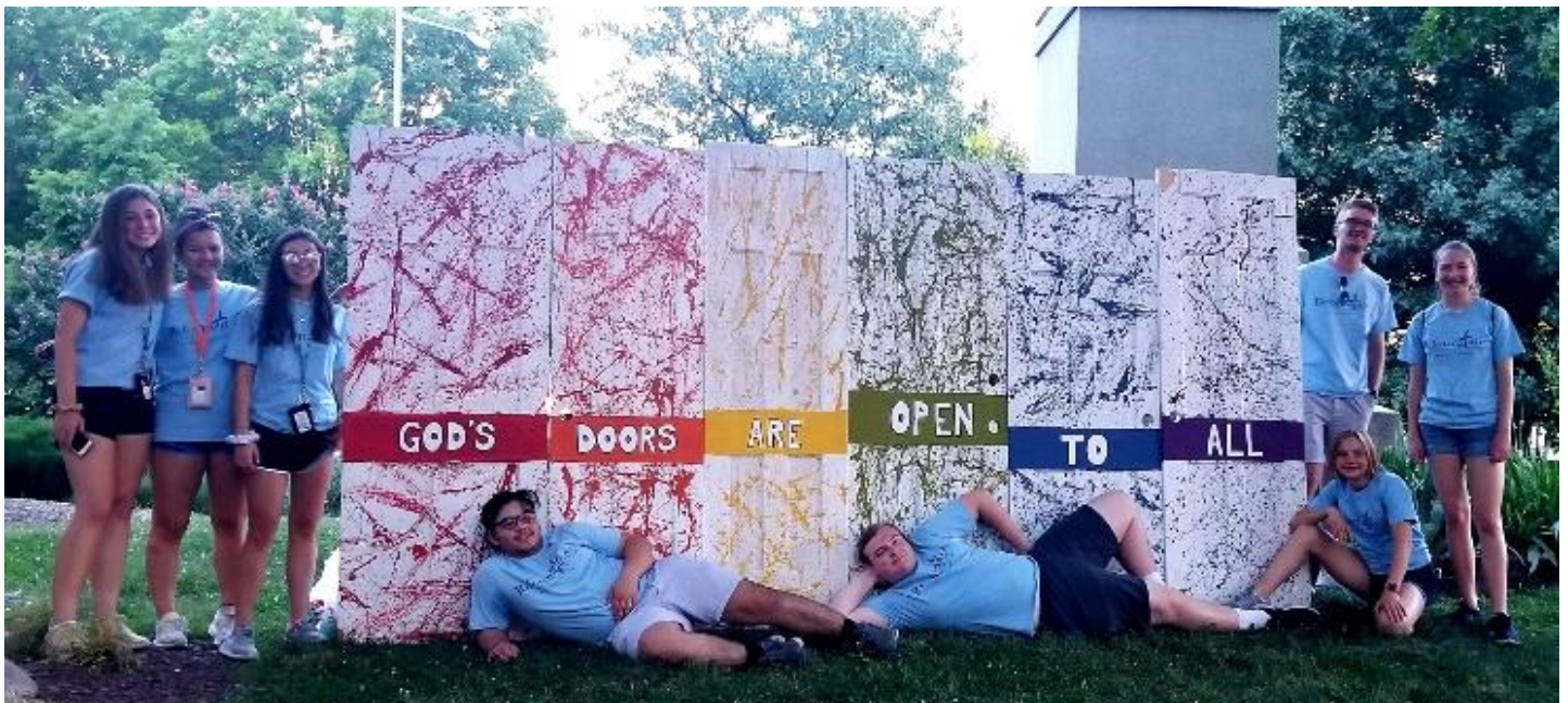
The Youth Summer Service Trip participants posing with the art display outside of Luther Place Memorial Chapel in Washington, DC, during the summer service trip at the end of June.

Your creativity and ideas for hospitality are welcome! Join in as we seek to invite, serve and build each and every week!