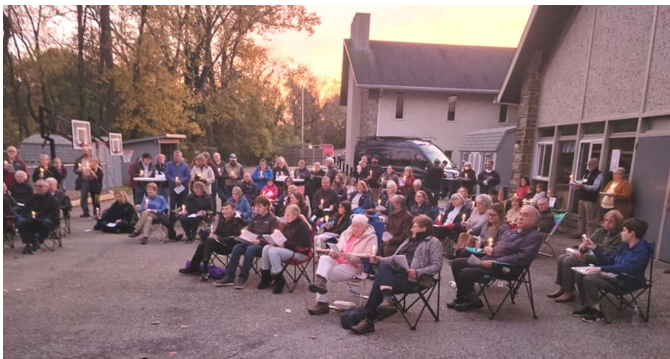
Reformation members and friends participate in the service of Evening Prayer and Thanksgiving at the Conclusion of a Call.