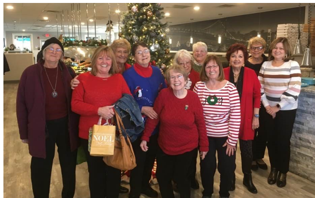
The Lunch Bunch had a festive get together on December 1 at Ashley's Restaurant in Glen Mills.