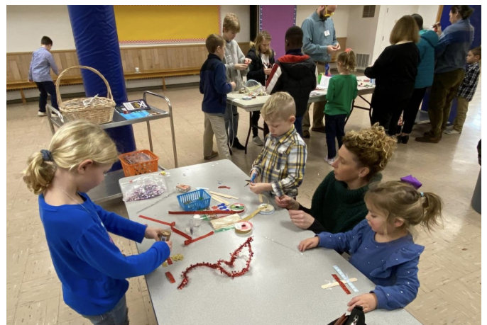
Our Sunday School students hard at work making new ornaments for the Reformation Christmas tree!