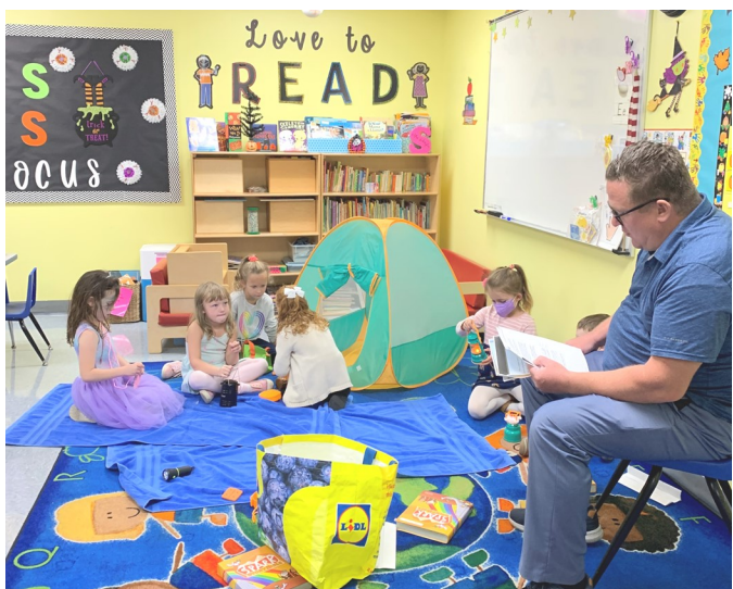
Story time at Sunday School.