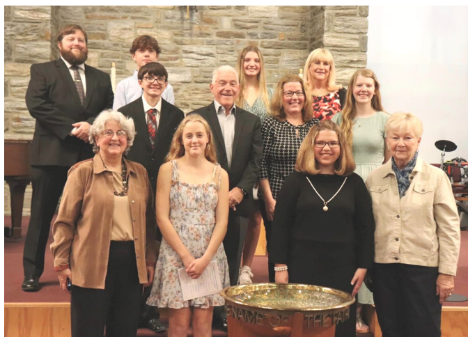
Our Confirmands with their mentors.