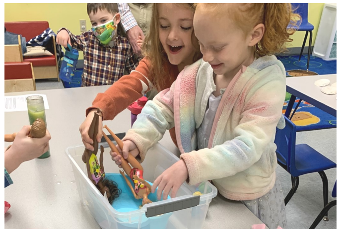
Our Sunday School students taking a hands on approach while learning about Jesus' baptism.