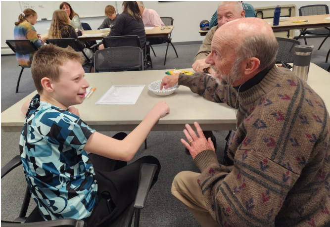
Confirmation students and mentors bless one another with water to remember their baptism.

It has been a busy start to 2023 as you can see in these photos! Please remember to send your photos of recent events to: newsletter@relcmedia.org .