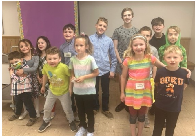
Our Sunday School students excited to help our neighbors in need on Caring for Friends Sunday, May 7.