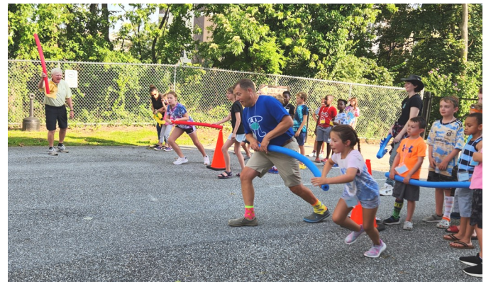
Children and adult leaders participate in relay races at VBS.