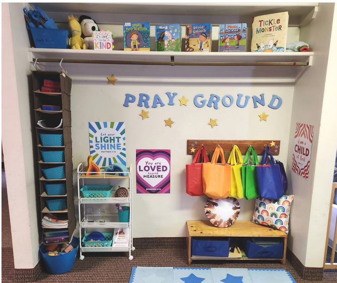
The Prayground in the Sanctuary received a makeover through a Thrivent Action Team grant.