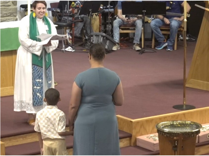
New members join Reformation during worship on July 30.

There is always so much to see at Reformation. We thank you for sharing your photos with us! Please remember to send your photos of recent events to: newsletter@relcmedia.org .