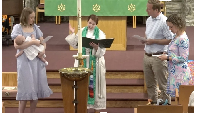
Celebrating a baptism during worship on August 6.