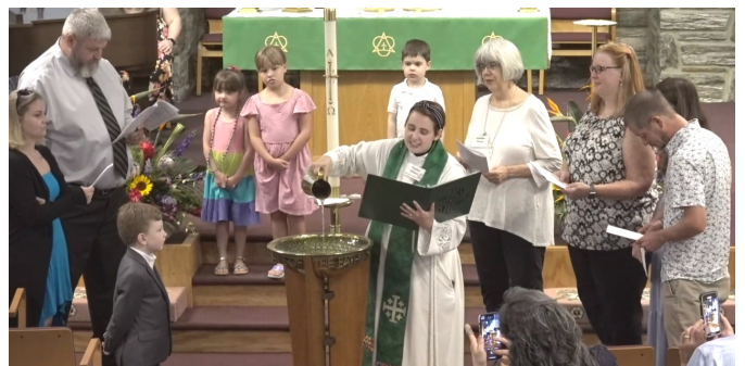
Celebrating a baptism during worship on August 13.