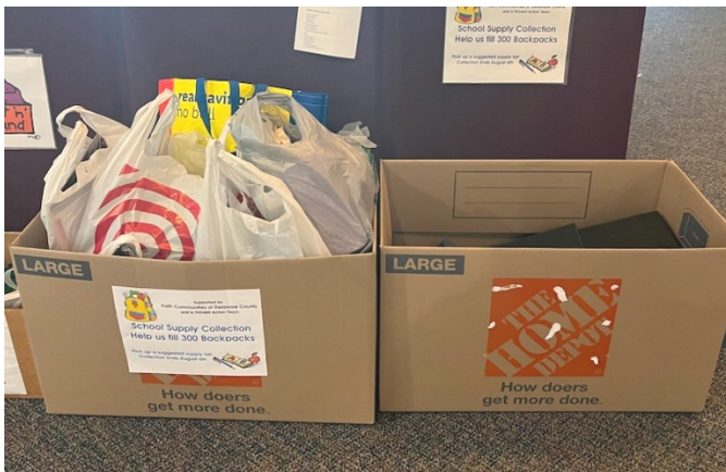
School supplies collected through the summer were sent out through The InterFaith Conference of Southern Delaware County.