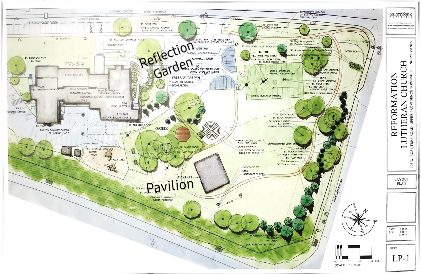
Proposed landscape plans with Pavilion and Reflection Garden.