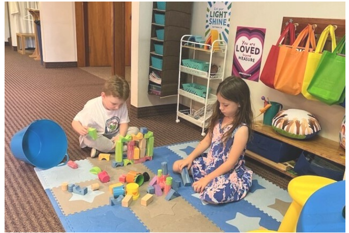
Some of our younger members enjoying the "Prayground" during worship on Sunday, October 1.