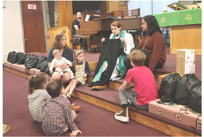
Blessing of the LIRS Bags during the Sermon on the Steps on Sunday, October 8.

Thanks to your generosity, we collected 52 bags of clothing for immigrants and refugees!