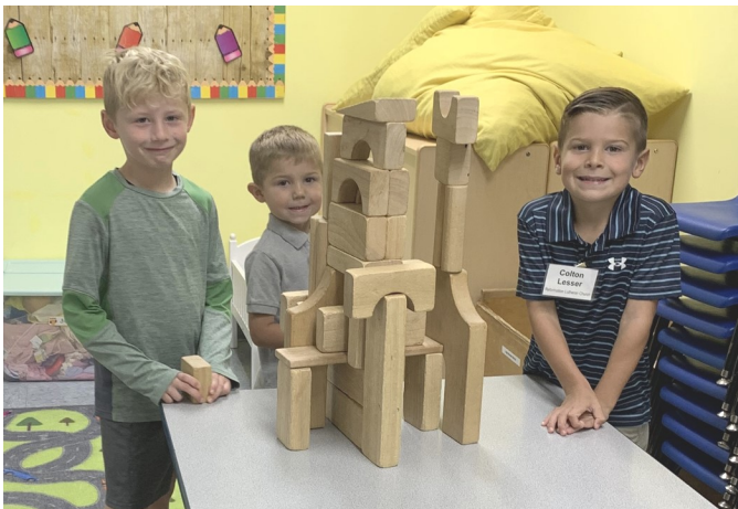
Sunday School students building their own vineyard after learning about Bible vineyard stories on October 1.