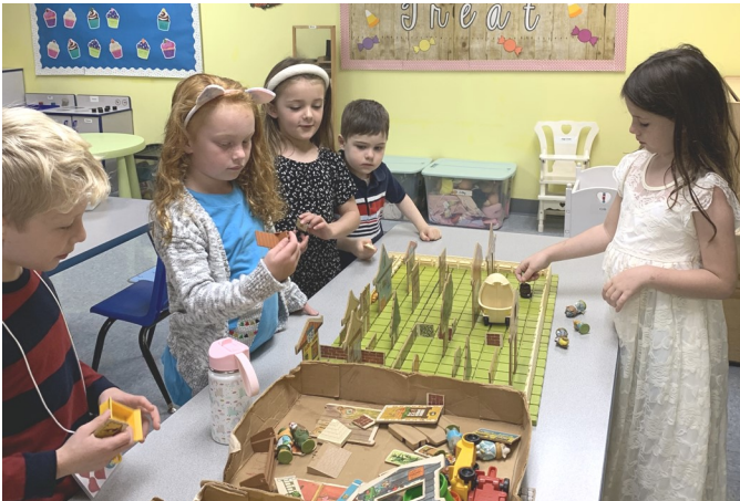
Sunday School students building their own vineyard after learning about Bible vineyard stories on October 1.