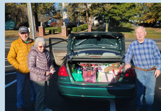
Thanksgiving Food Bags are delivered to local organizations.