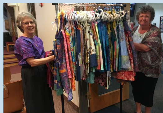
Handmade dresses are blessed for Dress A Girl.