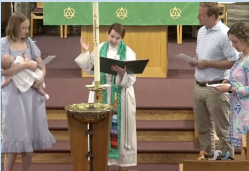
The Bridge family taking part in one of nine baptisms at Reformation.