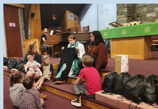
Children bless clothing bags for LIRS.