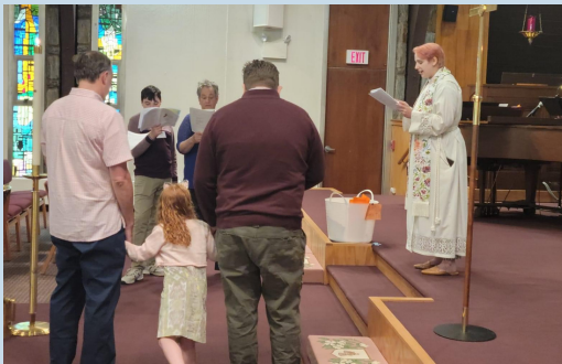
New members join the congregation through an Affirmation of Baptism.