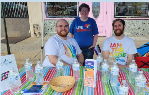
Members staffing Reformation's table at Delco Pride festival.

This year was full of inviting and welcoming all people! We celebrated 9 baptisms from newborn infants through elementary age children, we welcomed 14 new members, and we proclaimed God's love for all people through word and deed! Here is a glimpse at what our life looked like together this year by numbers: