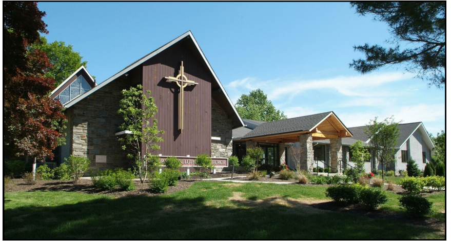
The most recent renovation to our building, in 2006, included adding handicap accessibility and made us an Energy Star certified building.

This campaign will move Reformation confidently into the future as we respond to God's call to invite all people, serve our neighbors, and build a living faith together!