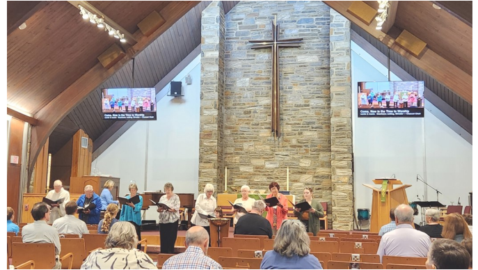
The Chancel Choir singing on Rally Day, September 8.