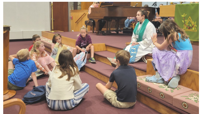
The Blessing of the Backpacks on Rally Day.