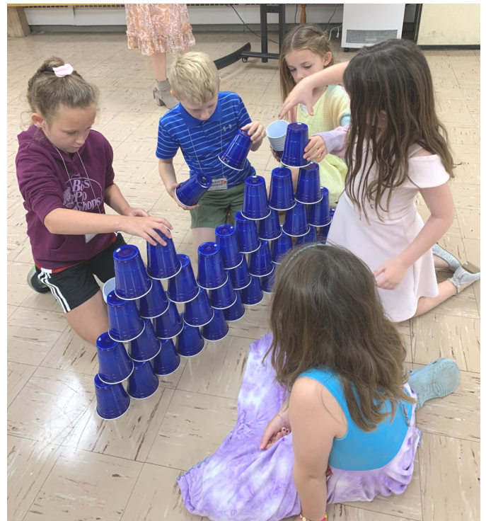
The 2 nd and 3 rd grade class competing in a cup stacking game on Rally Day