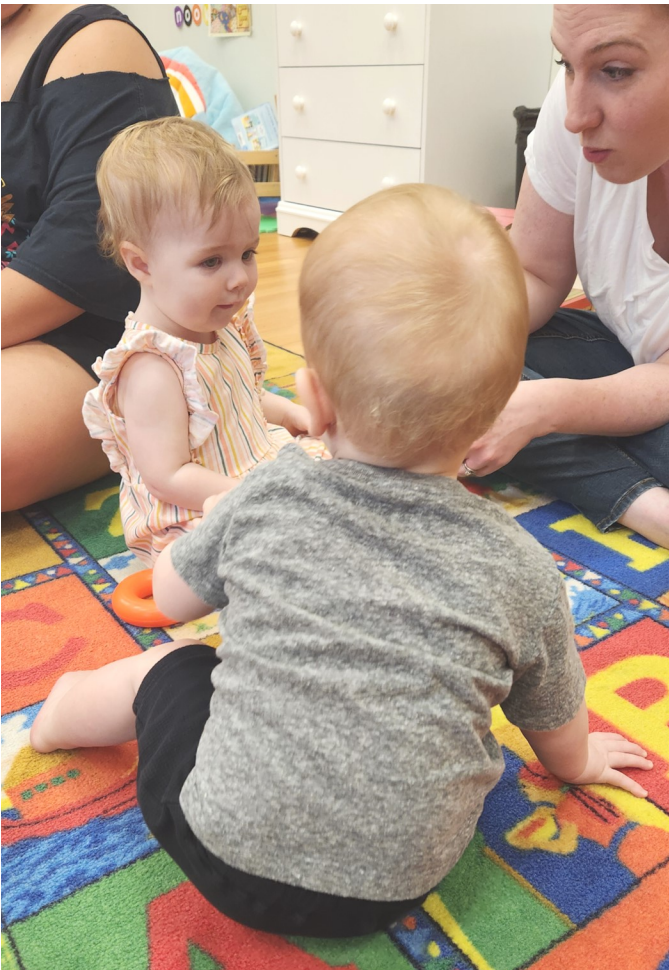
Making new friends at the Small Stars gathering on September 7.