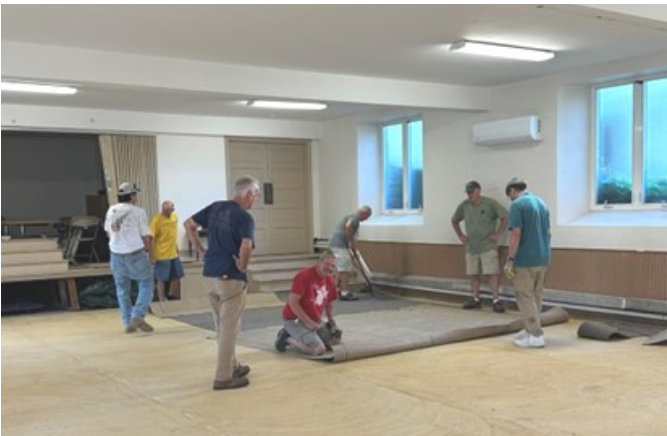
Volunteers remove carpeting. Renovations included new flooring, fresh paint, and other cosmetic upgrades!