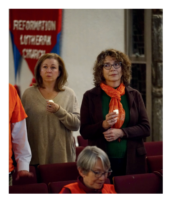
Reformation hosted and sponsored our second gun violence vigil with CeaseFirePA.

This year, we carried out our mission to build a living faith! Through community partnerships we worked for justice and advocacy. We took the command to love one another beyond Sunday morning by caring for the marginalized in word and deed. We connected with siblings of different traditions and backgrounds. Thanks for helping us live our faith inside and outside of the church, Reformation!