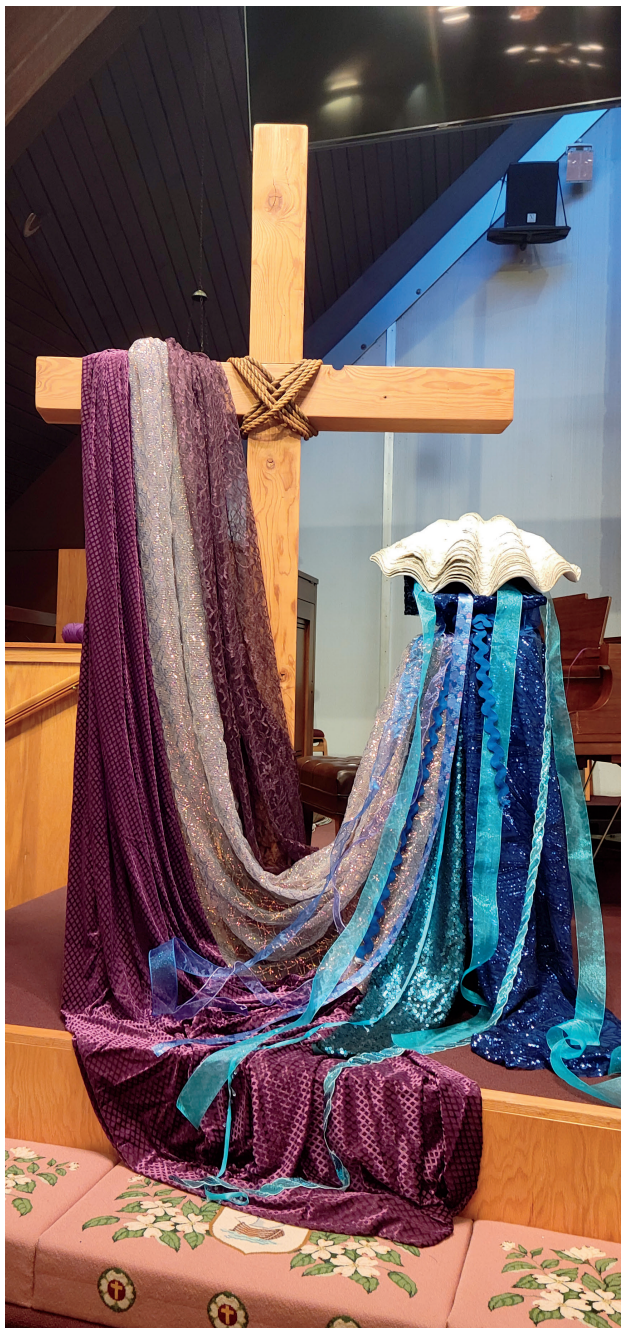
The Lent art installation: Renewed in Christ .