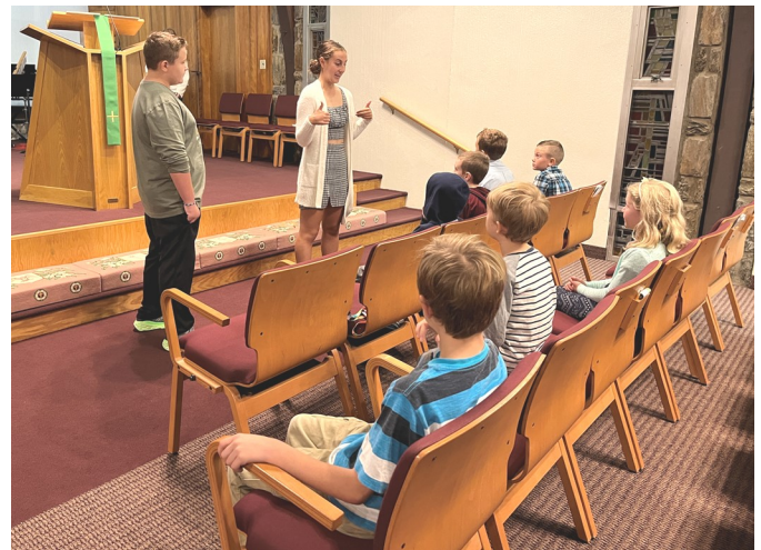
New Acolyte and Crucifer recruits being trained on October 2.