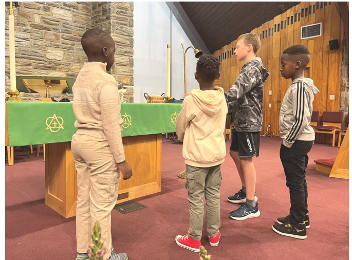
New Acolyte and Crucifer recruits being trained on October 2.