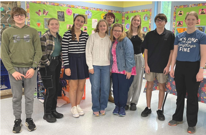
Our Breakfast Club High School Sunday School class held their final gathering of the year on May 12.