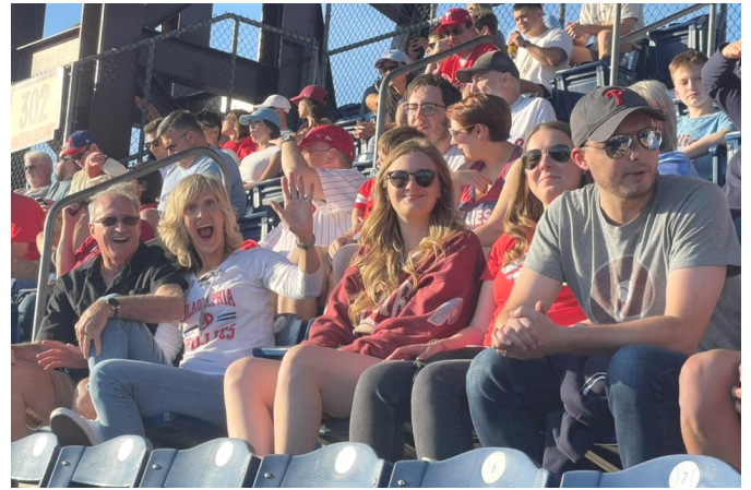
48 Reformation members enjoyed Lutheran night at the Phillies on May 31.